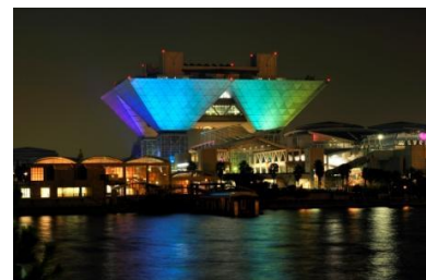
“Rainbow light-up illumination” of Symbol Tower