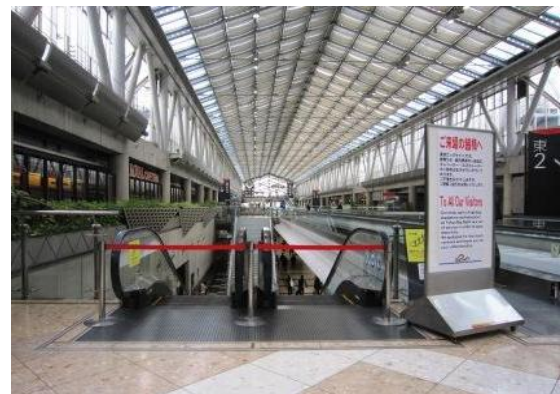
Partial stop of the escalator