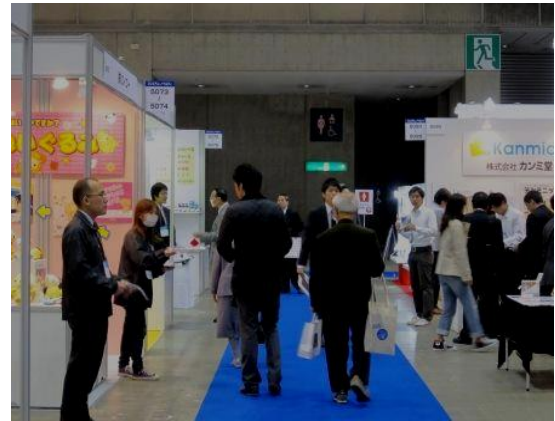
Lights turned off