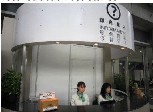
Installation of donation boxes at the Information Counter, etc.