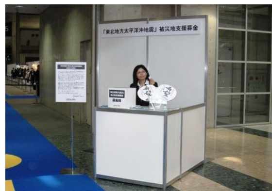
Installation of disaster area support fund-raising booth by organizer